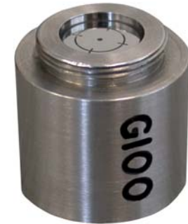
Precision certified calibration target

The camera is supplied with an adaptor for the standard PCS microscope. Camera calibration is done using a certified calibration target (supplied). The software also includes a facility for quickly checking the calibration if necessary.