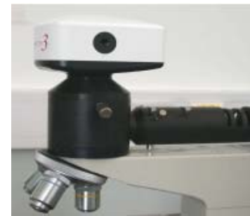
Microscope with camera in place.