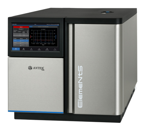
Figure 1. ElemeNtS Analyzer

The ElemeNtS analyzer detects these substances through a uniquely efficient process that includes Ultra Violet Fluorescence (UVF) and Chemiluminescence (CLD). The ElemeNtS analyzer combines the testing of Sulfur and Nitrogen for monitoring and protecting key processes in the refining industry.