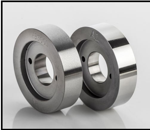
ABS test rings (BOCLE Ring left and

The fully automated instrument is included in ASTM D5001 test method “Standard Test Method for Measurement of Lubricity of Aviation Turbine Fuels by the Ball-on-Cylinder Lubricity Evaluator (BOCLE).” An optional PC based data logging application allows the test data to be recorded during a test. An upgrade kit is also available to enable the instrument to perform the ASTM scuffing load test for diesel lubricity (ASTM D6078). For further information, please contact PCS Instruments or your local dealer.