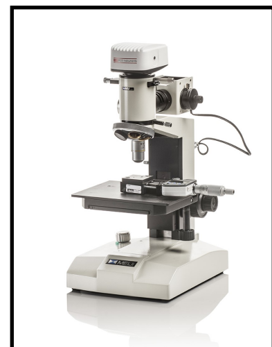
Microscope and wear scar camera attachment

An optional x100 microscope is available with an adaptor to accept the ABS ball holder. The microscope camera and software is an optional accessory for the ABS software which allows the user to capture calibrated images of a wear scar and measure the wear scar on the PC screen. The wear scar image and measurements are saved with the test data file and can be printed on the test report. The camera functionality is an integral part of the HFRR software, which allows test data files to be exchanged between labs and the measurements to be viewed and, if required, remeasured with full traceability. The package includes the camera and adaptor, all cables, and upgrade to the ABS software and a certified calibration target.