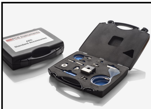
ABS Standard Accessories Kit

Spares, accessories, test specimens and reference fuels are available from PCS Instruments or your local dealer.