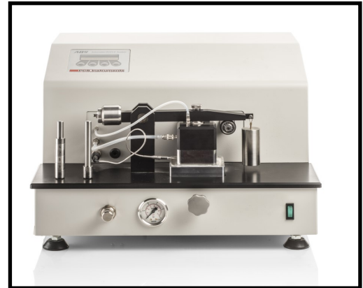
ABS mechanical unit

The ABS comprises a single, compact, bench top mounted unit. The only external services required are zero grade compressed air as specified in ASTM D-5001 and 100-230 V mains power. The internal de-ionised water reservoir requires refilling after approximately 1000 tests. An Air cleaner/dryer is available which can clean and de-humidify normal laboratory or shop air to meet the requirements of the ASTM standard (<0.1 ppm hydrocarbons and <50ppm water).