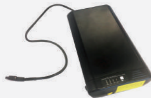
High-performance lithium ion battery with power supply