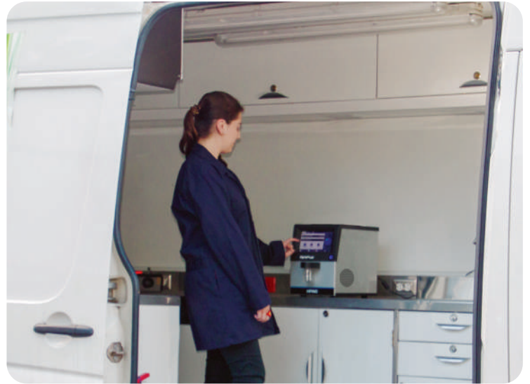
Mobile Lab is enclosed climate controlled lab with ambient temperature and humidity within product specification to obtain desired performance.

We used only the best materials to ensure it delivers unmatched performance in any application, and tested through intense shock, vibration and drop, per applicable IEC procedures.