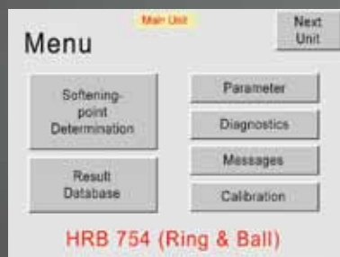
A. The HRB 754's "touch screen" display lets you quickly initiate standard softening point tests, change test parameters, run system diagnostics, and recall test results.