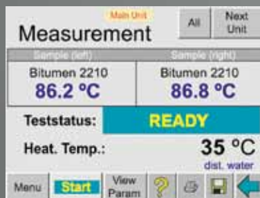
B. The HRB 754 displays measurement results on a bright, easy-to-read graphics display.